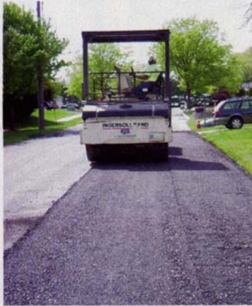
A tandem steel-wheel roller compacts the recycled pavement. After a two-week curing period, the township places a hot-mix overlay on the new base.

Cold-in-place recycling has proven to be a customer-friendly tactic in Bethlehem.