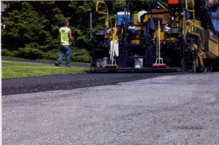
Breneman uses a hot-mix asphalt paver to place the cold-processed recycled pavement coming from the main recycling machine.

depth and width and machine speed. The cutting width is normally 10.5 or 12.5 feet.